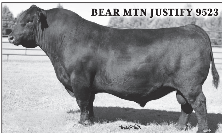
BEAR MTN JUSTIFY 9523