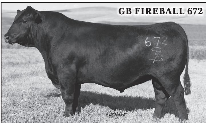
GB FIREBALL 672